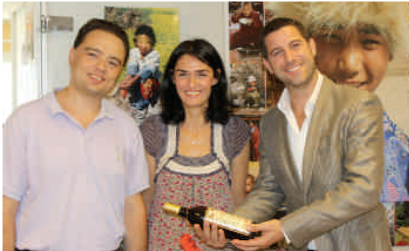
Through Facebook, a fan of Il Divo gave us the last "collector" bottle of the marriage of Romina Power with Al Bano, two very famous singers of the 80s: video promotion by Sébastien Izambard himself, soon on e-bay!