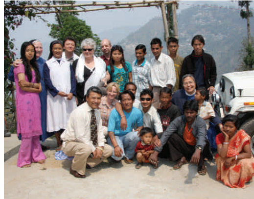
AMTM team during the mission of March 2010, with the members of the Sisters of Cluny HIV house

A ppointing right professionals at the right places by funding them through functioning donations is a necessity we mentioned in our previous revue and for which we appealed to your generosity. In consequence, since March 2009, there is a permanent counselor at the HIV house of Kalimpong in India the Sisters of Cluny set up to help AIDS patients who are more and more in this country. An essential position to be recognized by the World Health Organization (WHO) and also for patients. Indeed she follows-up health and social services for the patients. This job is essential in this centre of 20 beds where 70 to 80 persons are treated, mostly young people of 20 to 30 years