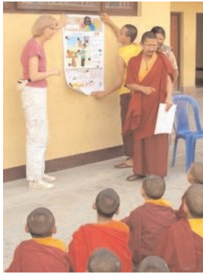
Attentive children at hygiene training