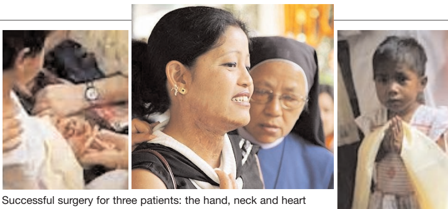
Successful surgery for three patients: the hand, neck and heart

Each year, AMTM seeks money so that patients can undergo surgery of which they have a vital need