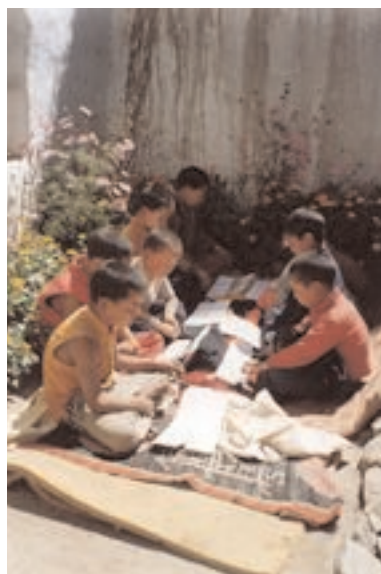
In the mountains of Mustang, young monks are learning in the monastery of Lo Ghe Gar.