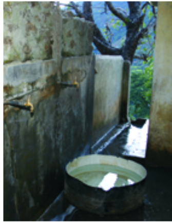
Monks of Palyul wash into a fountain one hour' walk away from the monastery.

T hree years ago, AMTM implemented a new water supply system to carry water to Palyul Monastery in Pharping. Water and hygiene are of crucial importance for health, and the result was that the skin diseases and bowel problems of the 250 children who live in this monastery-school immediately fell in a remarkable way. Villagers consider water as a source of life, and since they did not have access to it, they surreptitiously took water along the pipes AMTM had